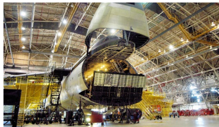
Robins AFB CEMACC