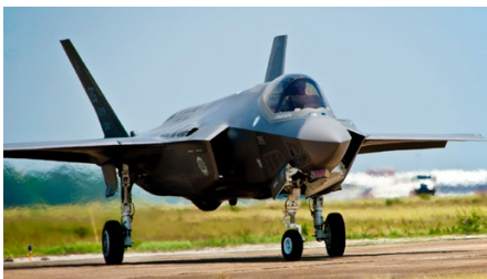
USAF/Royal Air Force BOA