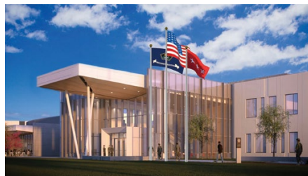
Fort Gordon MATOC