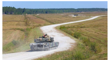
Camp Lejeune MACC