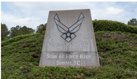
Shaw AFB 8(a) MACC