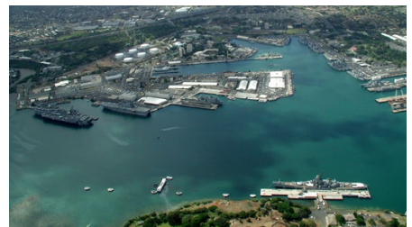
Navy Hawaii MACC